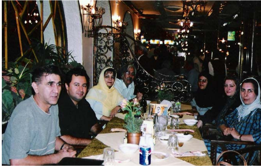
The people who make the journal possible in Tehran Chelokabi-ye Nayeb-e Vosara' summer of 2003 Luckily it is just around the corner of the office!!!